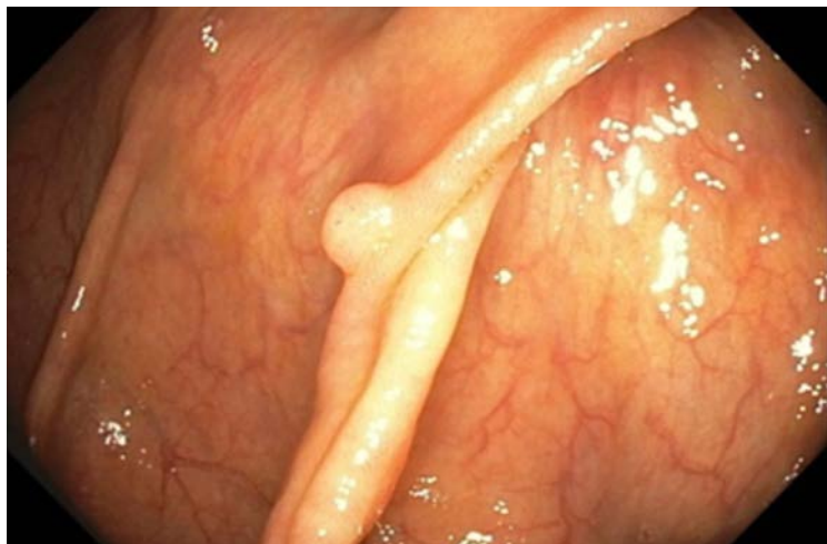
Figure 1. Colonoscopy showing a sessile 3 mm polyp in the rectum.