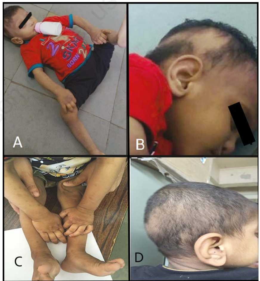
Figure 1. A) A restless child with intense itching, excoriated and dry skin; and B) a patch of hair loss on scalp before starting treatment. C) Significant improvement in skin texture with only few pigmented spots seen in both upper and lower limbs seen after two months of treatment; and D) recovering of alopecia after two months of treatment.

Hb, hemoglobin; TLC, total leucocyte counts; AST, aspartate transaminase; ALT, alanine transaminase; ALP, alkaline phosphatase; TB, total bilirubin; DB, direct bilirubin; TP, total protein; PT, prothrombin time.