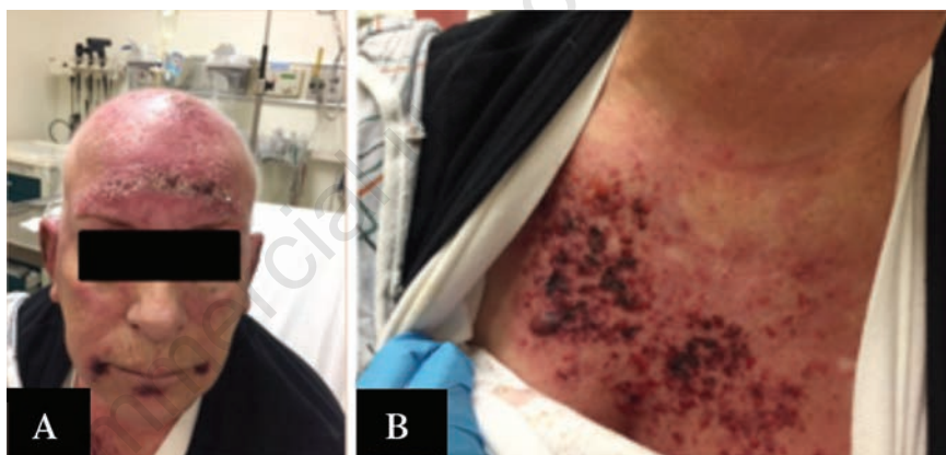
Figure 1. Images of the patient's skin rash and crusting lesions; A) periorbital edema and forehead skin breakdown; B) characteristic anterior chest wall (V sign) rash.

Dermatomyositis is a systemic inflammatory myopathy involving the skin, muscle, and connective tissue. DM is similar to polymyositis as they are both idiopathic inflammatory conditions; however, DM differs from polymyositis in that it exhibits