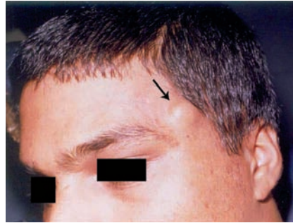
Figure 1. Clinical photograph showing the aneurysm, postero superior to the lateral orbital rim (black arrow).

Given the relatively long and exposed course of the superficial temporal artery over the temporal bone, STA aneurysms are less than 1% of