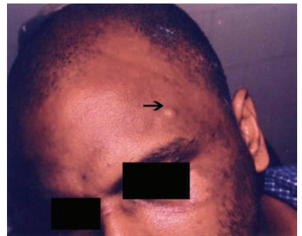
Figure 5. Clinical photograph showing the aneurysm above the left eyebrow.